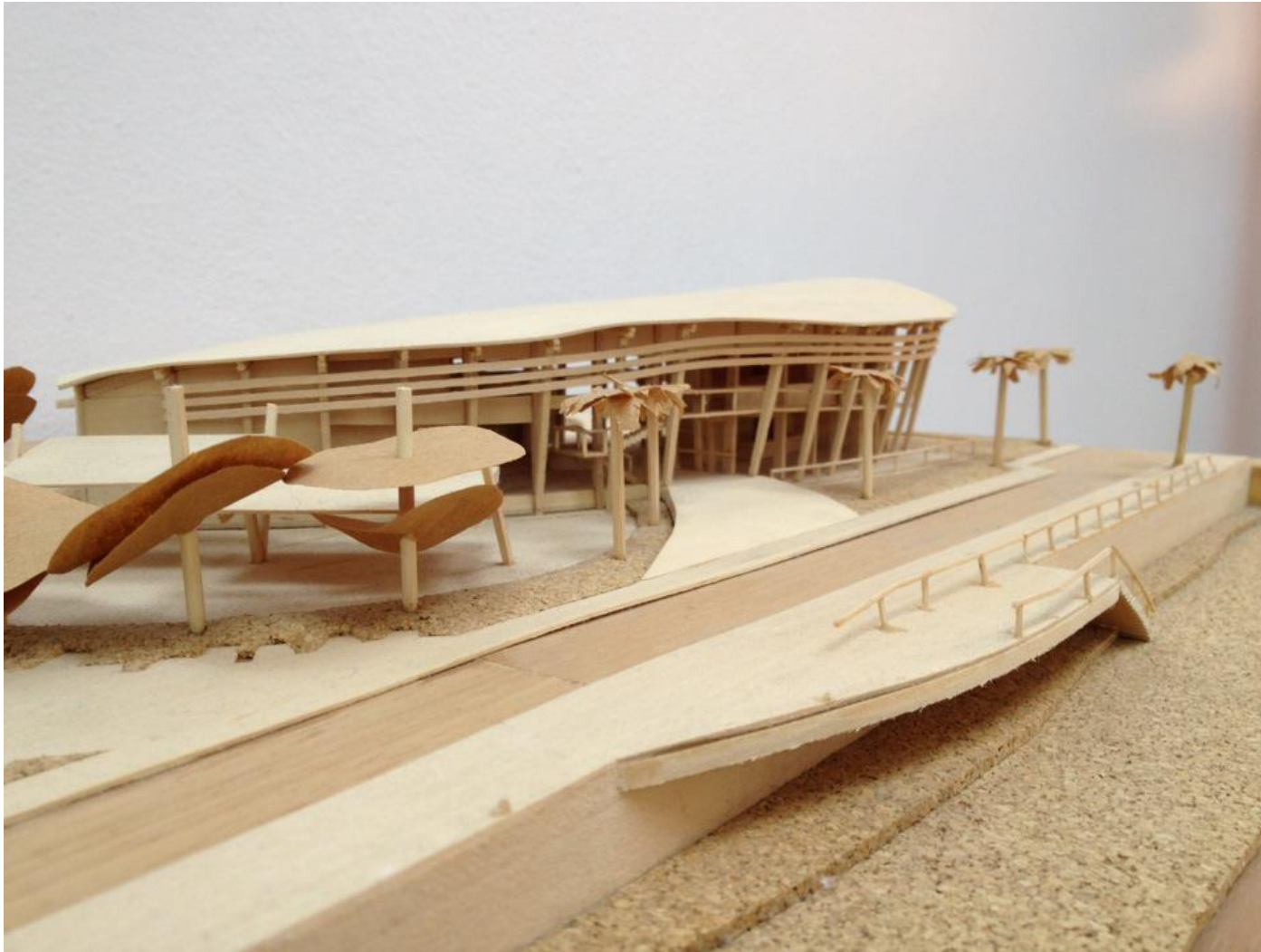
Maqueta del Centro de Visitantes para el Corredor Ecológico del Noreste realizada por estudiantes del Taller Comunitario de la Escuela de Arquitectura de la UPR.

Photo from Waldemar Alcobas, October 15, 2011